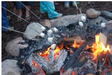
A campfire is often one of the highlights for participants.

A retreat allows youth to get to know other young people from around the district at the same time that they can get to know their pastor