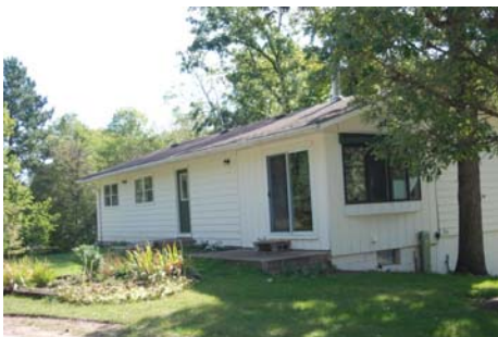
The Retreat House can house up to 20.

Fishing Boat. The cabin is equipped with a boat. If you would like to rent a boat motor the cost is $10 plus the cost of the fuel.